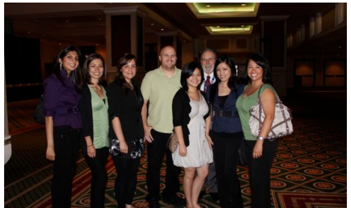
WESTERN UNIVERSITY- 2011 NOA CHAPTER OF THE YEAR

was an event to remember for NOSA members across the country. The convention began with the President's Welcome Reception in which NOSA members were able to meet one another for the first time or reunite from previous conventions! In addition, NOSA members were able to network with various NOA doctors, sponsors, corporations and organizations that were present at the event. Doing so placed them in the running for receiving one of the various giveaways donated by NOA sponsors and partners. The night was an excellent start to an exciting weekend!