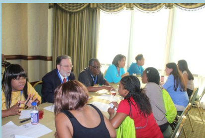
SUNY and MIDWESTERN NOSA members enjoying speed netting!