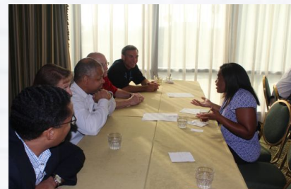
UAB NOSA Member Speed networking!