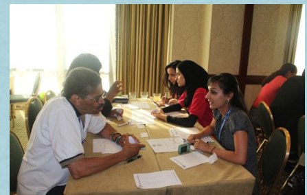
PACIFIC and ROSENBERG NOSA members speed netting!