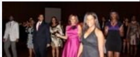
NOSA Members Dancing at banquet!

We topped off the evening with dancing and fellowship!