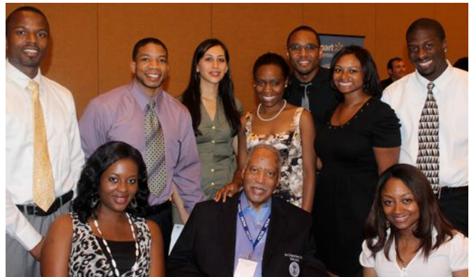
PENNSYLVANIA COLLEGE OF OPTOMETRY AT SALUS UNIVERSITY- 2011 NOSA CHAPTER OF THE YEAR