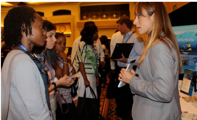
SUNY NOSA Members gaining valuable information at the President's Welcome Reception!